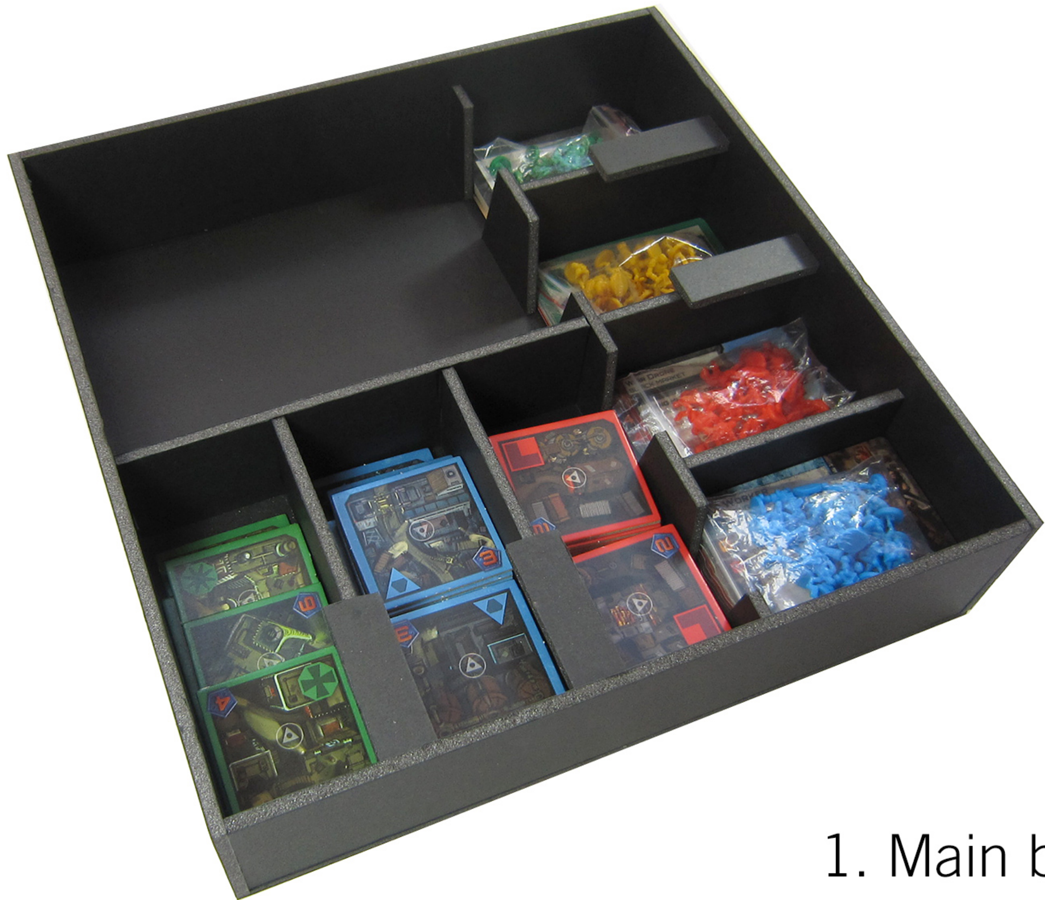
1. Main box