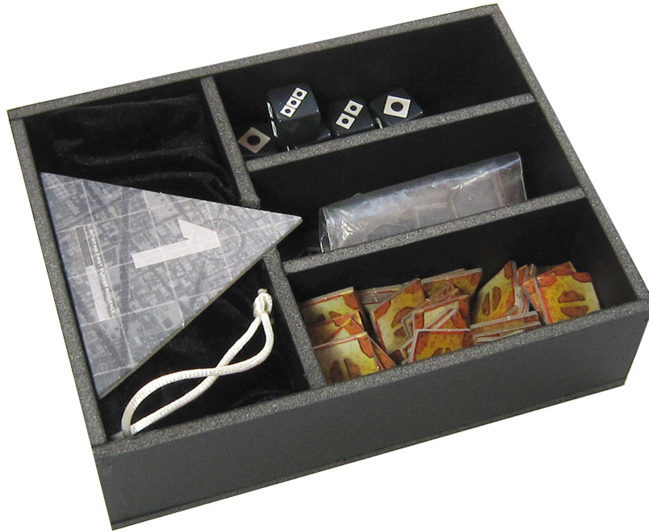
2. Counter tray