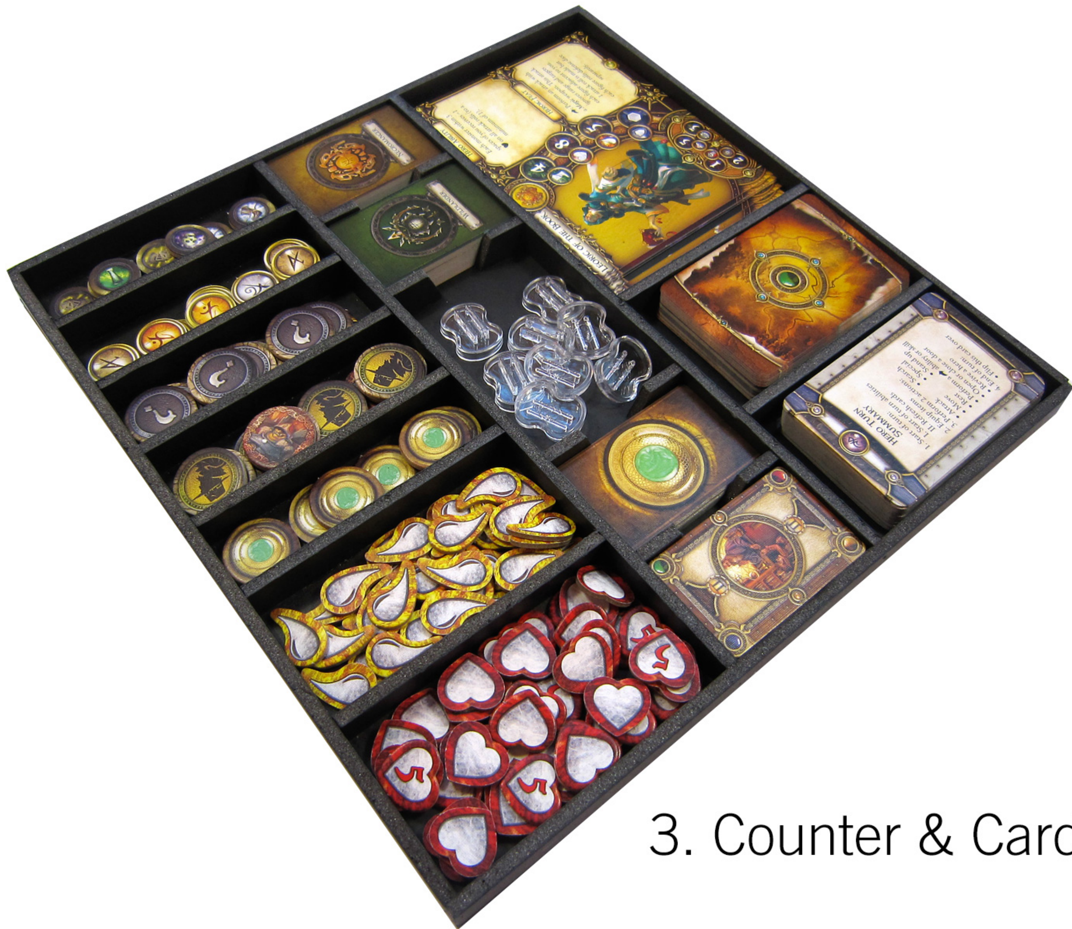
3. Counter & Card tray