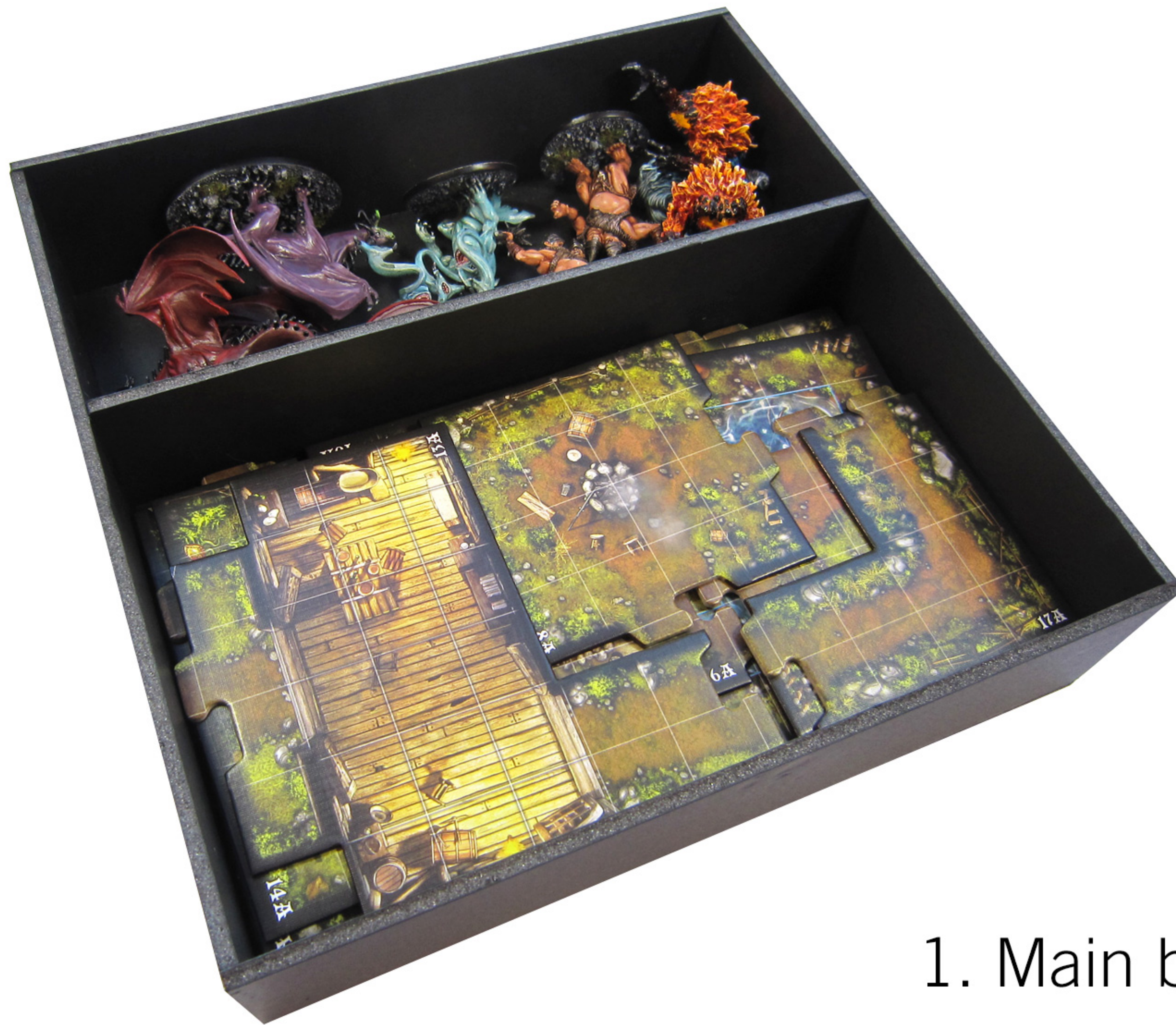
1. Main box