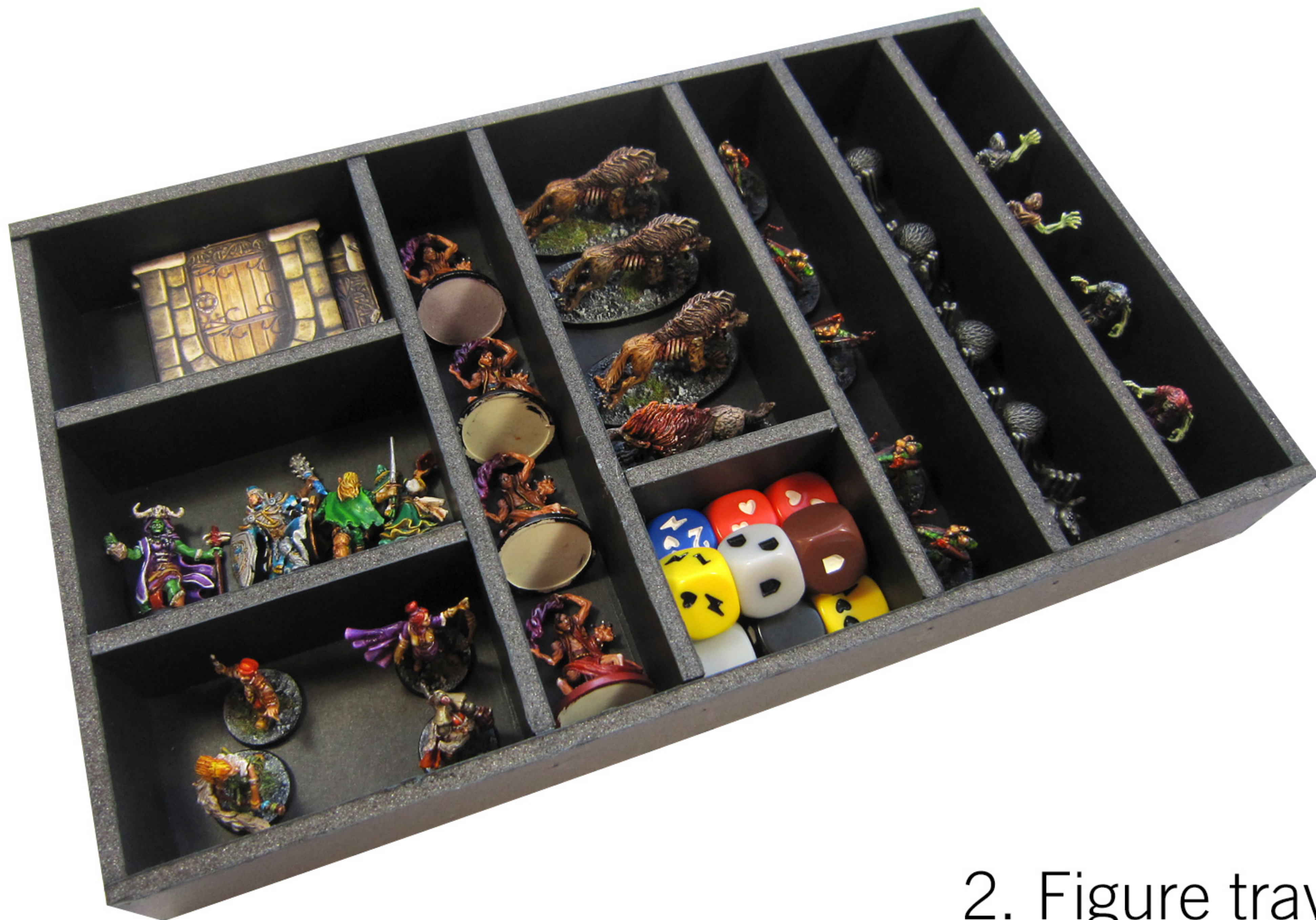
2. Figure tray