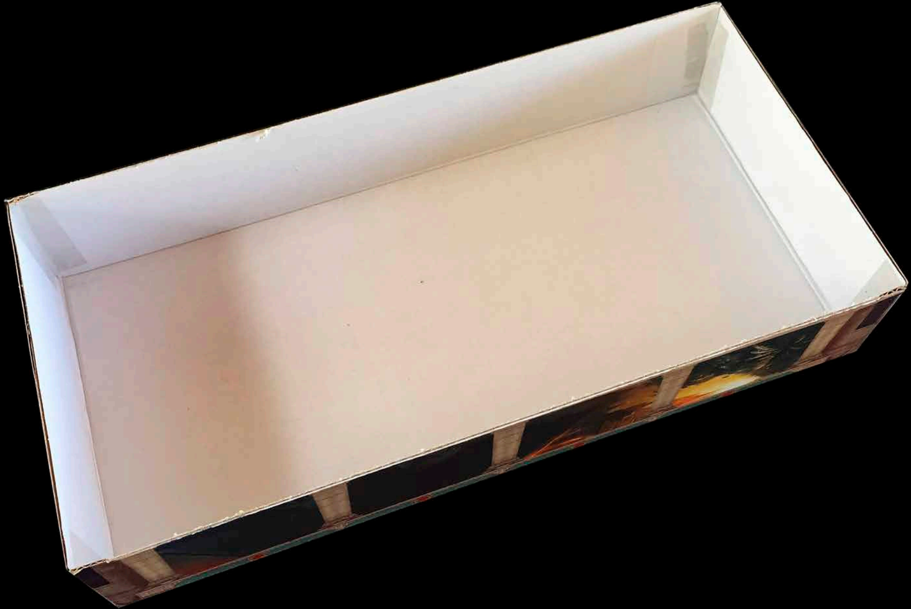
The underside of the cardboard box insert lid, with corners held together with sticky tape.